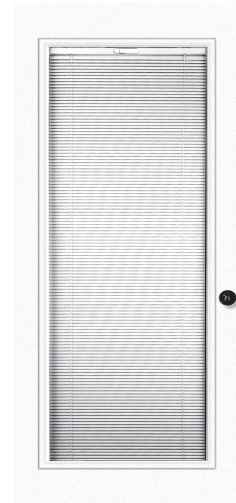
Full Door with VSL-IG-MB 2460 W