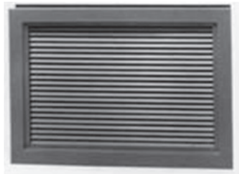
600A1 Photo & Drawing

Inverted "V" Blades with 60% Free Area - Recommended for Schools, Class "A" and Institutional Buildings